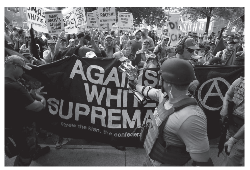
Anarchists at the front of clashes with white supremacists in Charlottesville, Virginia in August 2017.

We see the legacy of these successes in the emerging legal and medical infrastructures supporting the Justice for George Floyd protests. For example, the Northstar Health Collective in Minneapolis, which provided critical support for the protests, was founded by anarchists during the mobilization against the 2008 Republican National Convention.