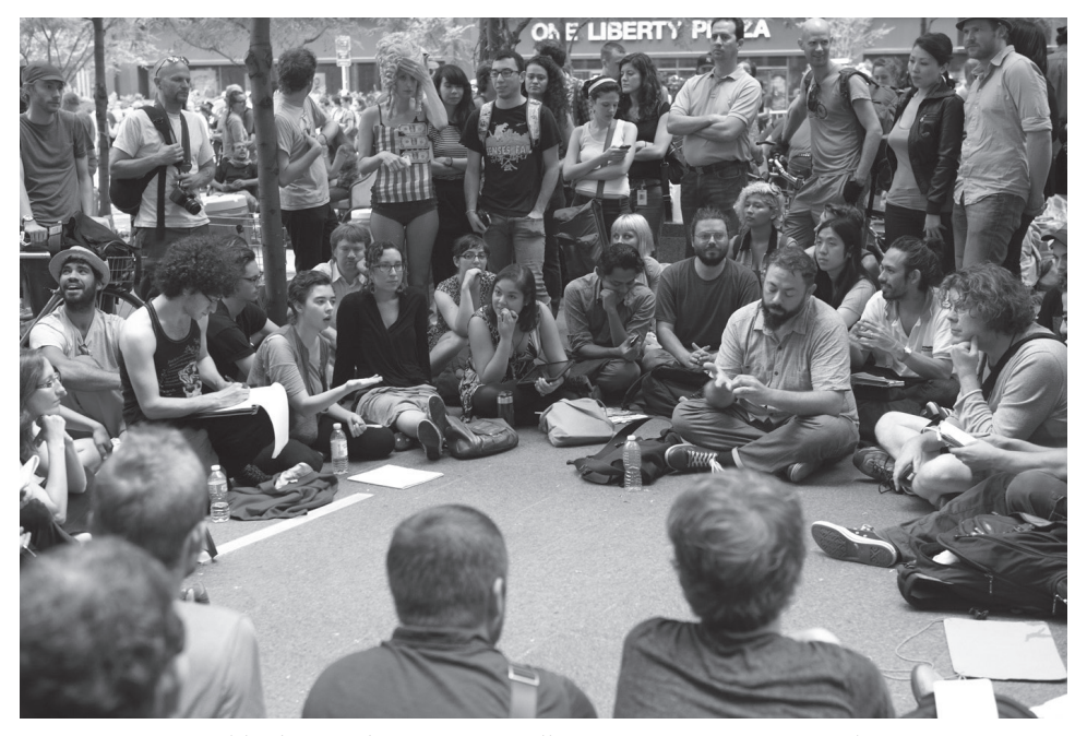
An assembly during the Occupy Wall Street protests in September 2011.

So far, none of the reforms that politicians propose, such as civilian review boards or body cameras, have served to diminish police violence on a nationwide level. Neither have legal responses, such as bringing lawsuits